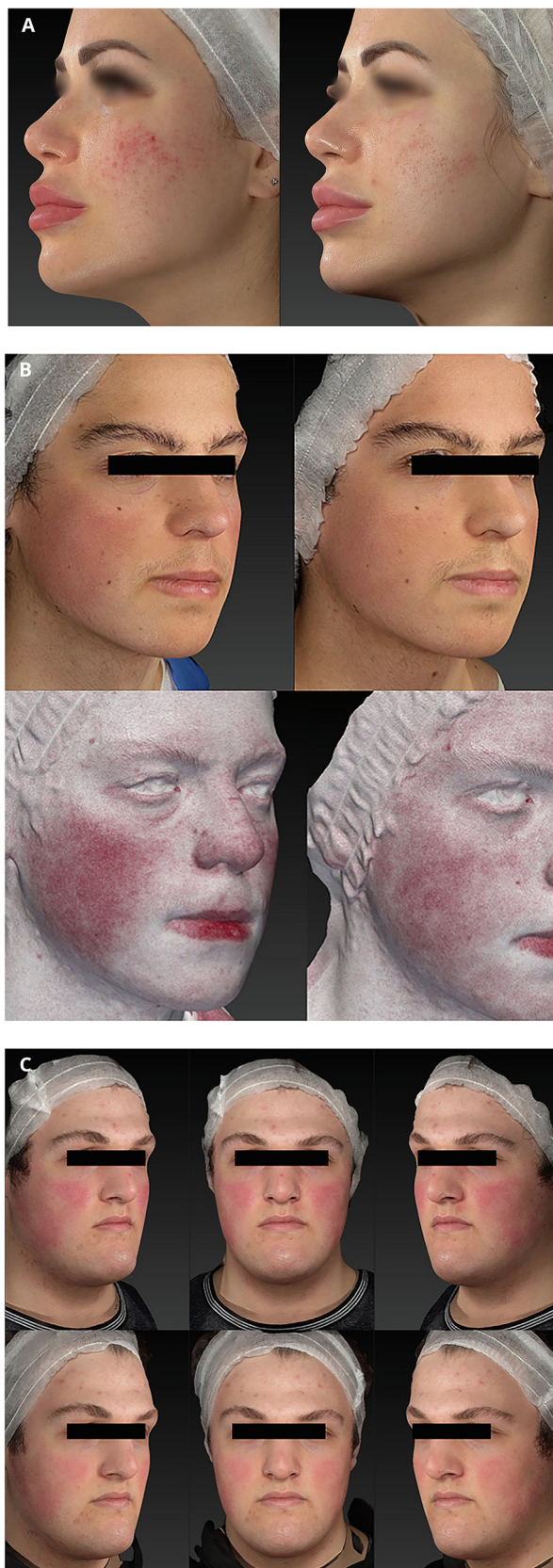
Fig. 1. Plates A, B and C show erythematous rosacea before (above) and after (below) treatment using the "in motion" technique.

with the traditional method. In this case series using Nd:YAG laser with an "in motion" technique, a reduction in side effects and pain was observed among treated patients. The limitation of our study is the small number of patients included. Our future goal is to increase the number of patients treated with evaluation of recurrence rates and disease-free intervals after two laser sessions.